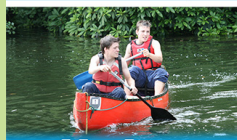
2 Seat Canoes