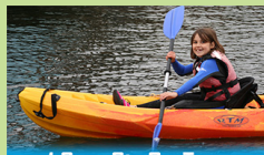
1 Seat Sit-On-Tops