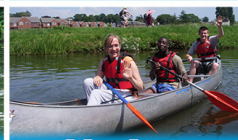
3 Seat Canoes