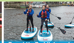
Stand Up Paddleboards