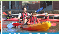
2-3 Seat Sit-On-Tops