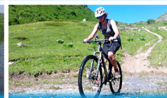
Adult Mountain Bikes